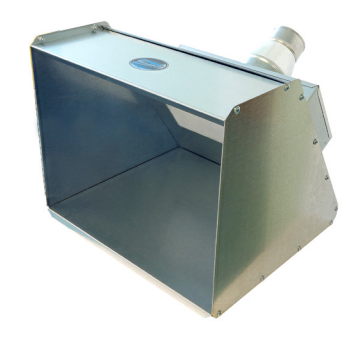
HSSB-22-16 Hobby or artist airbrush spray booth